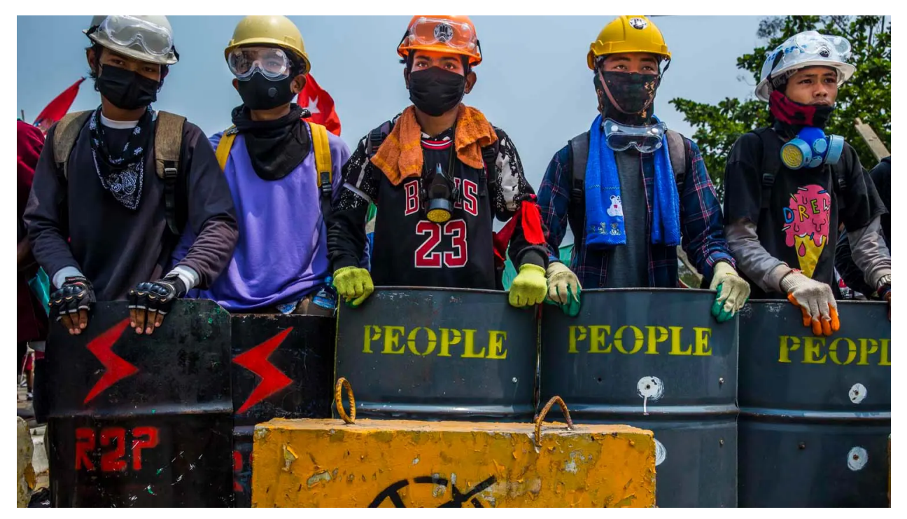
With Autocrats on the Defensive, Can Democrats Rise to the Occasion?